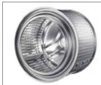
Large Stainless Steel Diamond Drum with 4.3 cu. ft. capacity*