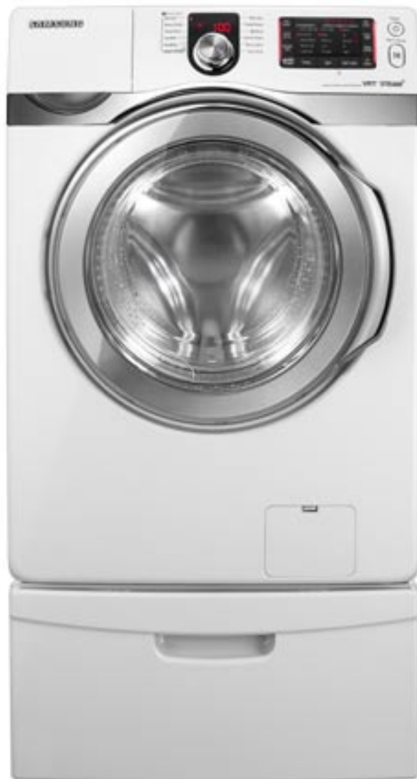
(Shown with optional pedestal)