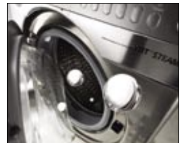
ActivFresh™ Technology actively cleans and freshens clothes in cold water.